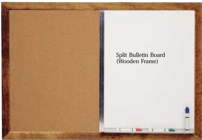
Split Bulletin Board (Wooden Frame)