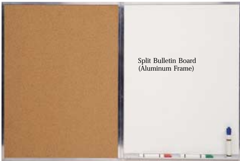
Split Bulletin Board (Aluminum Frame)

The whiteboard/corkboard split combination allows you to use an erasable marker on one side and tack messages on the other.