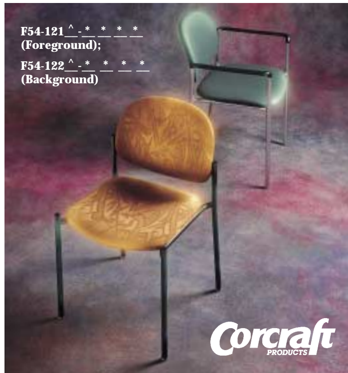
F54-121 ^ - * * * * (Foreground);