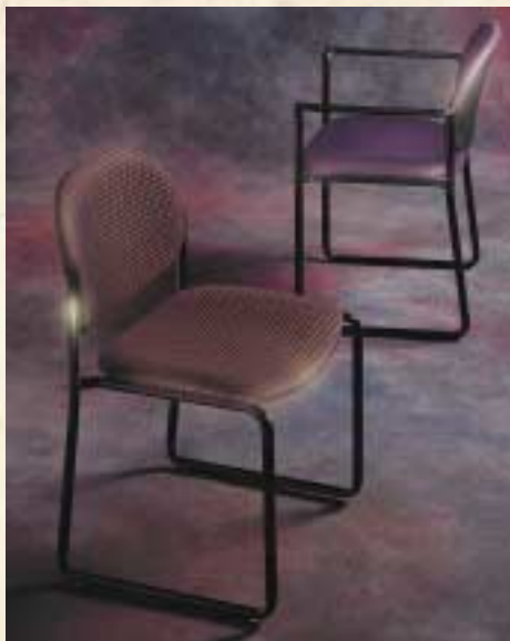
F54-123 ^ - * * * * (Foreground); F54-124 ^ - * * * * (Background)