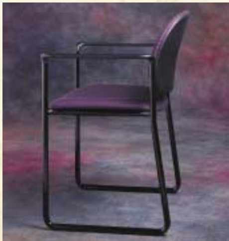
F54-124 ^ - * * * *