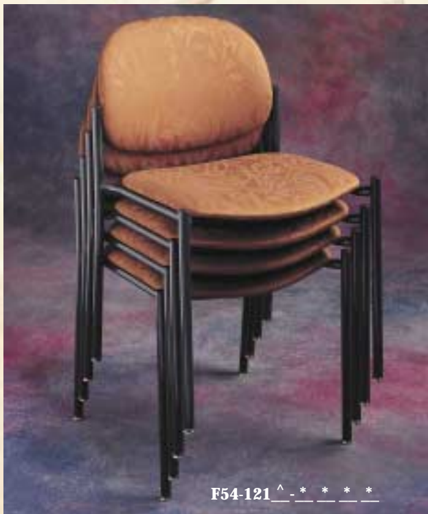
F54-121 ^ - * * * *