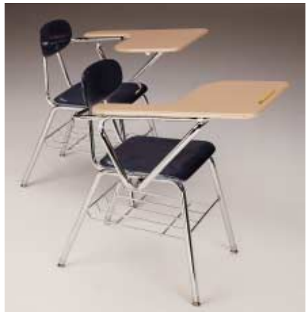
(Left) F54-1014BT-41LH [Left Hand Top] and (Right) F54-1014BT-41

F54-1011BT- * * 24W X 40D X 30H Weight 40 lb