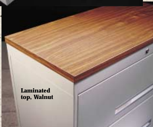
Laminated top, Walnut