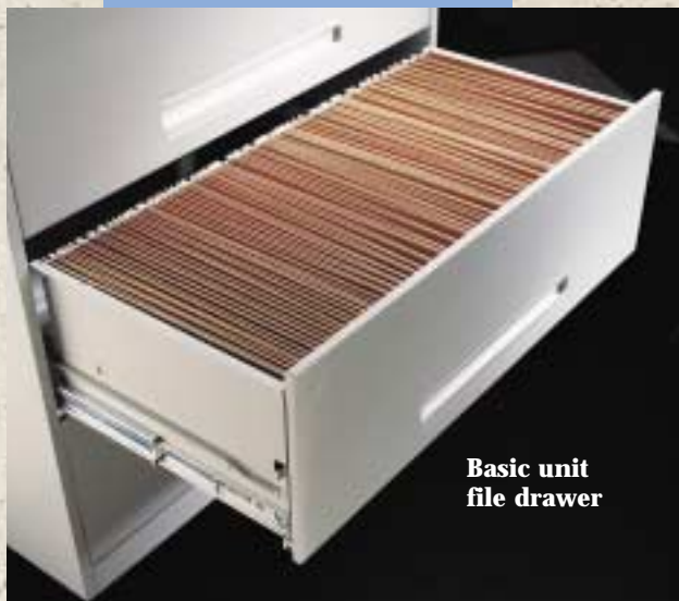
Basic unit file drawer

A wide variety of sizes, styles and options allows for complete flexibility in space planning.